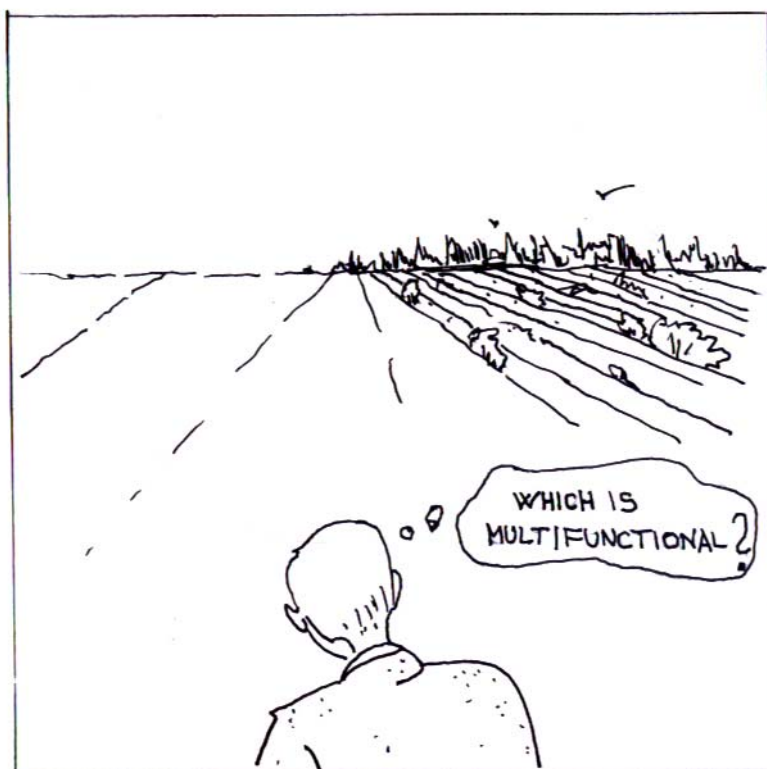
Sketch: Aleksander Magyar